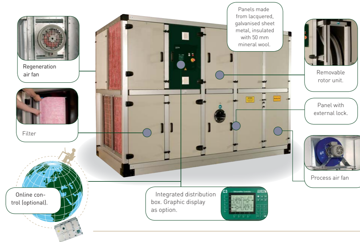
The drawing shows the RF-122 standard