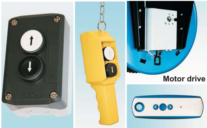
Wall mounted control device

The exhaust hose reel is connected to a separate fan or a central extractor system.