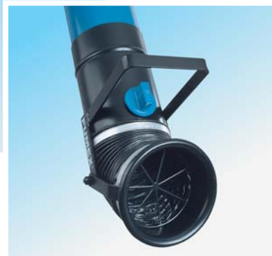
Suction nozzle with 360° swivel

The FUMEX local extractor RX, with lengths 1.5, 2, 3 and 4 m, is equipped with a gas spring that balances the dead weight of the arm. For this reason, the RX is extremely easy to handle at the same time as it stays without rebounding when positioned, even in the outer positions. The suction nozzle incorporates a swivel function and may be rotated 360° and moved to a 90° angle. This allows the suction nozzle to be positioned as required.